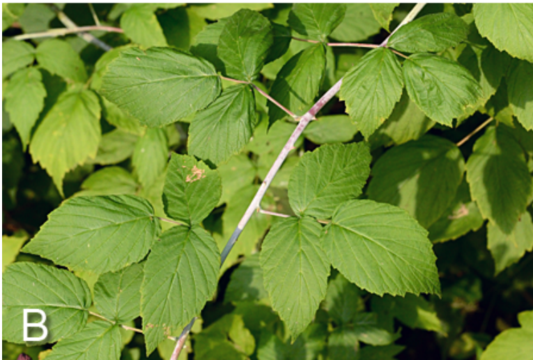
Figure 3. In June, a cluster of native black raspberries (A) offers a tempting snack for wildlife while a daddy longlegs rests on a leaf to the right. Black raspberry leaves have three leaflets (B). Their powdered branches start off green but turn purplish by winter. The slightly hooked thorns are smaller than those of Himalayan blackberries.

The best way to eradicate Himalayan blackberry is by pulling it out and extracting all of the roots. Those rhizomes are shallow and have a simple, cable-like structure yet they extend quite a distance from the mature plant. Since the root can break and a new plant may grow from the remaining fragment, getting all of the rhizome is imperative. Routinely cutting and digging eventually kills this weed, though it may take several months to a year or so. Depending on the type and time of year, herbicide treatments have varying results and should not be used if people are still nibbling on the berries. When applying herbicides, always follow the product labels and wear appropriate personal protection equipment, including chemical-proof gloves and safety glasses.