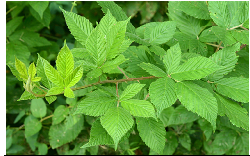
Figure 1. Himalayan blackberry's emerald green leaves usually have seven (sometimes three) leaflets. Both leaves and stems possess barbs.

Good alternative species: black raspberries ( Rubus occidentalis )