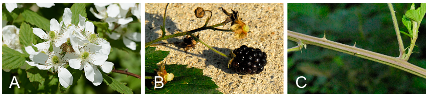
Figure 2. Himalayan blackberries five-petaled blossoms (A) are white. Their flowers are similar to other Rubus and multiflora rose , which also bloom in May. Himalayan blackberry fruits (B) ripen in July and have larger fruits than their relatives. Thin, vicious spines (C) may pierce leather gloves. These thorns are at a nearly 90° angle to the flat-sided stem.

The Himalayan blackberry escaped cultivation and spread rapidly due to birds and mammals eating the fruits and then depositing the viable seeds elsewhere. While invasive plants often prefer germinating in recently churned soil (e.g., cleared or tilled within several years), Himalayan blackberry seeds sprout and grow anywhere from fields and gardens to mature, undisturbed forests. Once established at a spot, the plant sends rhizomes from which other new shoots emerge. Their spiny branches reach up to 10 feet long, making it the largest Rubus member growing in Northern Virginia. These branches have five sides; looking down a perpendicular cut, one sees a pentagon. Some of the branches die back in the winter and the shrub generates lengthy branches from mature roots within a growing season. Unable to support their own weight, the branches arch down and send roots anywhere they have prolonged soil contact. Whereas the berries nourish some wildlife during the short fruiting season, an insufficient number of other organisms, including pathogenic microbes, eat the roots, stalks, or foliage throughout the rest of the year. The result is sprawling tangles of thorny, ecologically worthless weeds that displace valuable native flora.