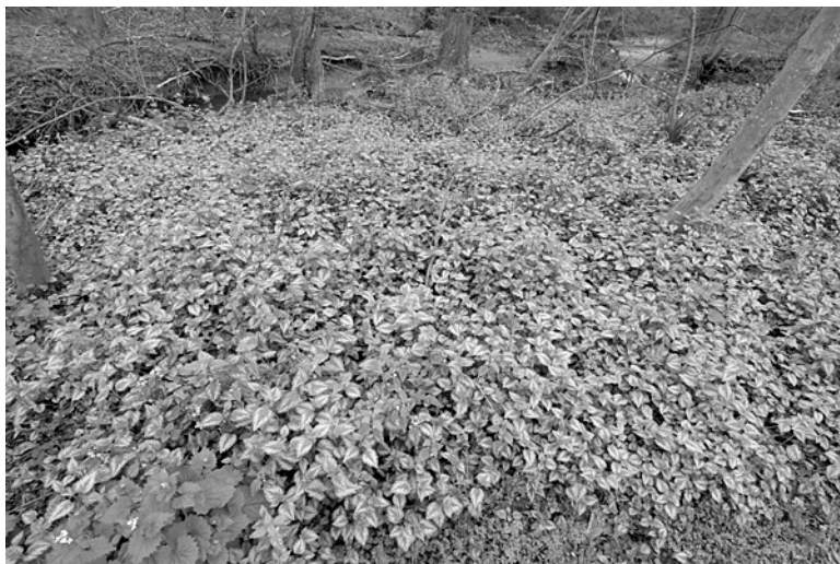
Figure 2. This yellow archangel patch grows in Kings Park West Park, within the Royal Lake watershed. It is hemmed in by a creek and other aggressive, non-native invasive weeds, such as garlic mustard and English ivy.

Comments: There was a time when gardeners looking for a plant with attractive foliage and pretty flowers would choose yellow archangel ( Lamiaeum galeobdolon , previously under the genus Lamium ). After all, this predominantly European species spreads readily and is easy-to-grow, adapting to many soil conditions and any amount of sun or shade. Therein lies the problem: yellow archangel, a member of the mint family, Lamiaceae, grows too easily and spreads uncontrollably! Many folks who planted yellow archangel regretted their decision after realizing that the weed is not so much a groundcover as it is a ground smotherer. It rapidly overtakes an immediate area with subterranean runners called stolons. Seeds, up to 800 per plant per year, expand the plant’s coverage even further. Without any natural controls, yellow archangel crowds out most plants except for other non-native invasive species.