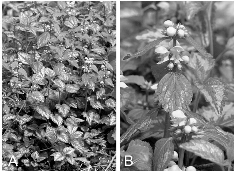
Figure 1. Another common name for Lamiaeum galeobdolon is “aluminum plant” since the foliage’s variegation casts a metallic sheen (A). Yellow archangel blooms in April (B). The squared stems and opposite leaves help to indicate it is a mint relative.

Good Alternative Species: wild strawberry ( Fragaria virginiana ) , green-and-golds ( Chrysogonum virginianum ), Virginia waterleaf ( Cornus amomum ), marsh marigold ( Caltha palustris ), and golden Alexander ( Zizia aurea ), native mints ( Pycnanthemum sp.)