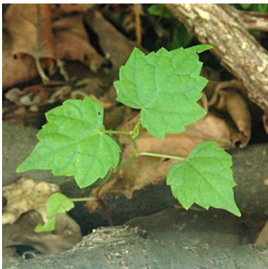
Figure 2. This porcelainberry seedling has inch-long leaves. Identifying and pulling it now is easier than killing a mature vine.

Comments: Recently, many people asked about a strange, grape-like vine growing either in their yard or in the parks. The most conspicuous part of this newfound plant is its fruit, which ripen from August through November, and are cream, turquoise, blue, pink, and violet in color—all on the same vine! The opalescent berries sound stranger than fiction yet give this plant its common name, porcelainberry (sometimes spelled “porcelain berry”). Such a chromatic berry sounds intriguing and attractive, and so thought the people who imported the original specimens into the northeastern United States in the latter nineteenth century. The problem with porcelainberry is its densely foliated vines and fast growth, which together choke out groundcover, shrubs, and even some trees. Birds eat the abundant fruits and spread the seeds. Without locally native biological controls, this botanical curio grew into an out-of-control weed, hitting Virginia through New England the hardest and expanding into the Deep South and Midwest.