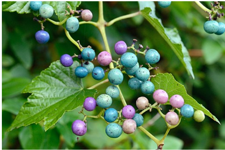
Figure 1. Porcelainberry leaf and new growth vine morphologies resemble grapes but the flamboyant fruit distinguish this weed. Berry skins facing the sun tend to be lighter than the rest of the fruit.

Whereas Ampelopsis plagued Northern Virginia for decades, folks notice it now due to its soaring population. Sometimes mistaken for kudzu , porcelainberry is one of this area’s most devastating weeds, on par with oriental bittersweet and wisteria . Until recently, the Fairfax County Park Authority’s Invasive Management Area (IMA) volunteers at Royal Lake were unable to strike porcelainberry as workdays focused on eradicating other high priority weeds. Earlier this year, new IMA Site Leader Angela Thornburgh led Royal Lake’s first session dedicated to porcelainberry control. Using hand tools such as jab saws, her team first cut the vines, killing any growth above the slice and destroying developing seeds before they matured. With a Weed Wrench to minimize soil disturbance, roots were extracted thereby preventing any more sprouting.