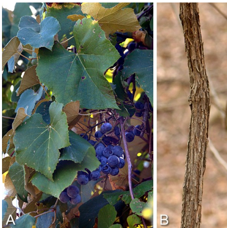
Figure 5. Porcelainberry is often mistaken for grapes, pictured here. Adding to the confusion, the related vines share a similar leaf form and grow next to each other. However, grape fruits (A) always hang down and, depending on the species, tend to be purple, green, or reddish. Mahogany-colored, flaky, fibrous bark (B) differentiates mature grape vines from porcelainberry.