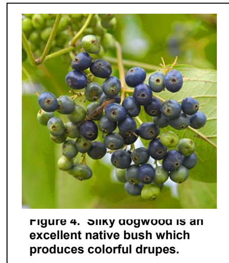
Figure 4. Silky dogwood is an excellent native bush which produces colorful drupes.

Many Virginian vines can be used as a native alternative to porcelainberry. Grape is the most similar; while it provides the gardener with tasty snacks, it can become a handful and should be trained on a trellis. Common moonseed ( Menispermum canadense ), another vine, sports broad leaves. For chromatic berries, try silky dogwood ( Cornus amomum ), which grows into a large shrub.